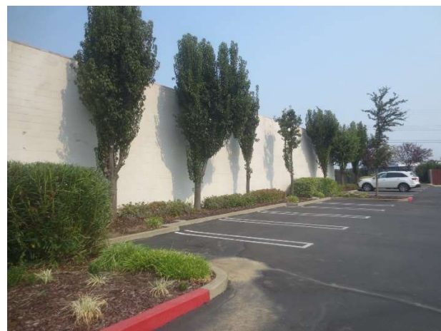
South Elevation, Block wall on property line