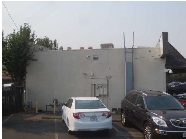
East Wall with utility services