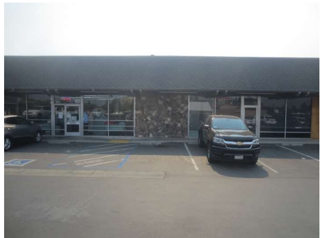
North Elevation, West half, empty hair salon on right