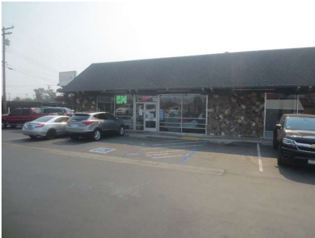
North Elevation, East half, Existing Laundry on left